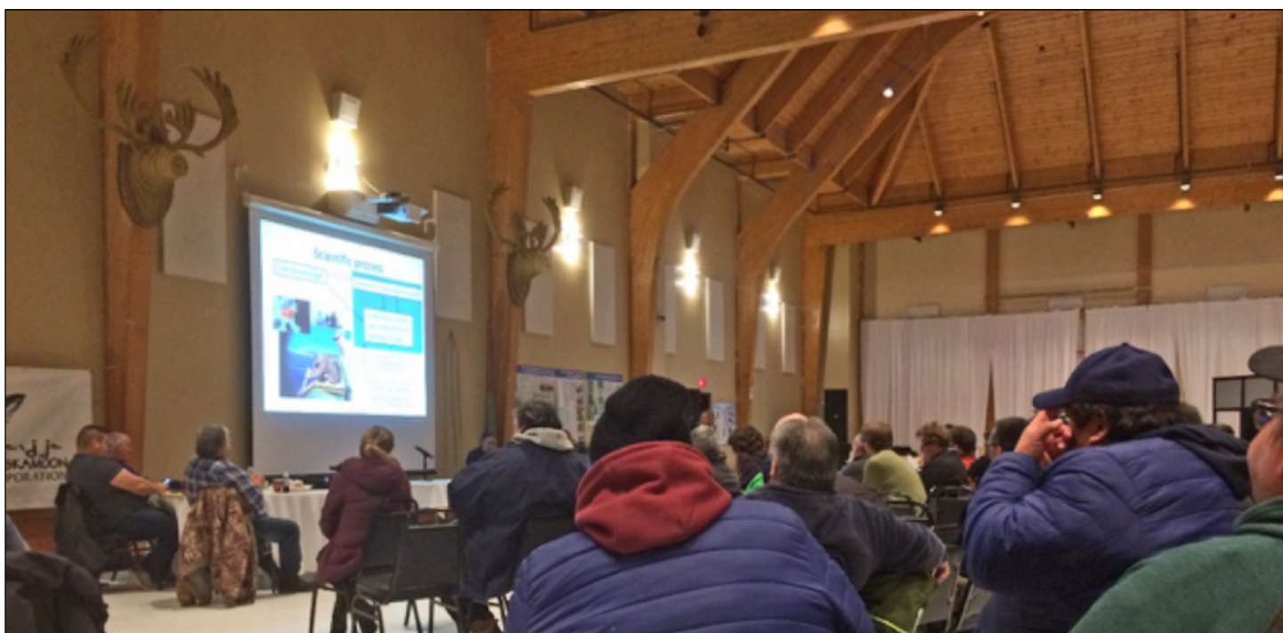
Yaayimutitaa Shikaapaashkwh - Let's talk about eelgrass Symposium, Chisasibi Banquet Hall January 29-31, 2019

A symposium on eelgrass was held in Chisasibi in January 2019. There were many exchanges with coastal land users regarding the goal and objectives and outcomes of the research project. The different research teams presented the initial results on the first two days, followed by a day-long workshop on how to improve communication and integration of Traditional Knowledge.